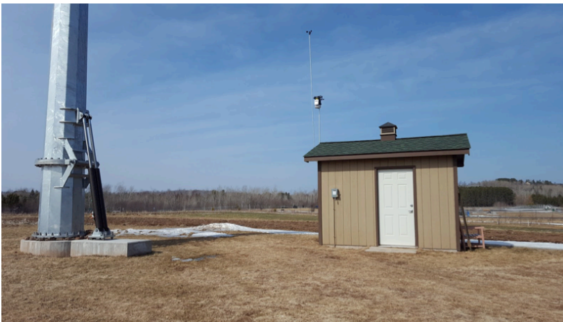
New Weather Station at the Land Lab